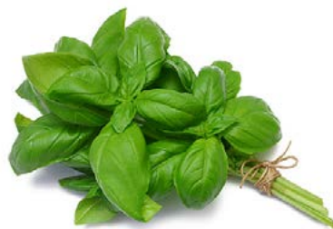
Basil is popular for growing in the summer months.

You would not think of sesame seeds as a traditional American flavoring, but how many times have you seen a generous sprinkling of sesame